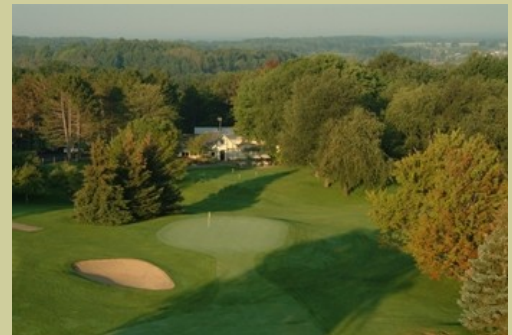
McGuire's Resort Golf Course.