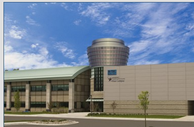
Lansing Community College West Campus

Friday, June 18 on the West Campus of Lansing Community College.